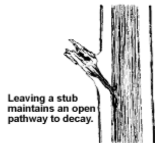
Leaving a stub maintains an open pathway to decay.

The preferred location to make a pruning cut is just beyond the branch collar at the branch's point of attachment. The tree is biologically equipped to close such a wound, provided the tree is healthy enough and the wound is not too large. Cuts made along a limb between lateral branches create stubs with wounds that the tree may not be able to close. The exposed wood tissues begin to decay. Normally, a tree will “wall off,” or compartmentalize, the decaying tissues, but few trees can defend the multiple severe wounds caused by topping. The decay organisms are given a free path to move down through the branches.