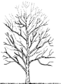
If the height of a tree must be reduced, all cuts should be made to strong laterals or to the parent limb. Do not cut limbs back to stubs.

The cost of topping a tree is not limited to what the perpetrator is paid. If the tree survives, it will require pruning again within a few years. It will either need to be reduced again or storm damage will have to be cleaned up. If the tree dies, it will have to be removed.