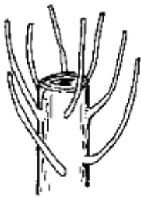
New shoots develop profusely below a topping cut.

Topping often removes 50 to 100 percent of the leaf-bearing crown of a tree. Because leaves are the food factories of a tree, removing them can temporarily starve a tree. The severity of the pruning triggers a sort of survival mechanism. The tree activates latent buds, forcing the rapid growth of multiple shoots below each cut. The tree needs to put out a new crop of leaves as soon as possible. If a tree does not have the stored energy reserves to do so, it will be seriously weakened and may die.