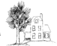
Trees that have been topped may become hazardous and are unsightly.

Without leaves (up to 6 months of the year in temperate climates), a topped tree appears disfigured and mutilated. With leaves, it is a dense ball of foliage, lacking its simple grace. A tree that has been topped can never fully regain its natural form.