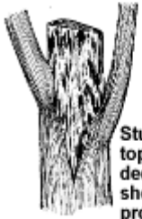
Stubs left from topping usually decay. The shoots that are produced below the cut are weakly attached, and often become a hazard.

The survival mechanism that causes a tree to produce multiple shoots below each topping cut comes at great expense to the tree. These shoots develop from buds near the surface of the old branches. Unlike normal branches that develop in a socket of overlapping wood tissues, these new shoots are anchored only in the outermost layers of the parent branches.